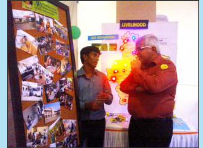
Donor Engagement Event in Mumbai