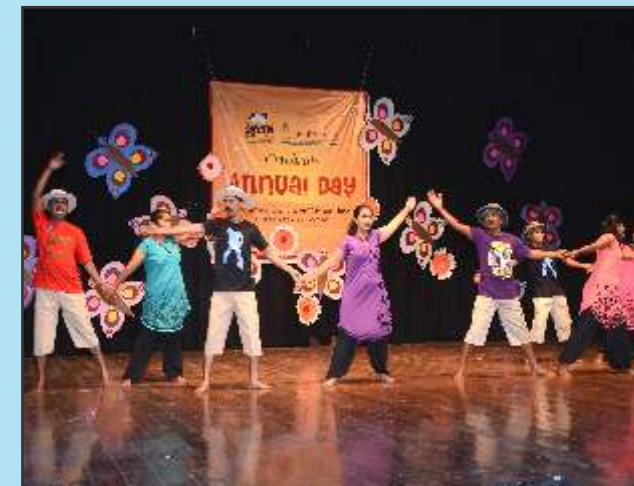
Staff performance during Annual Day 2014-15