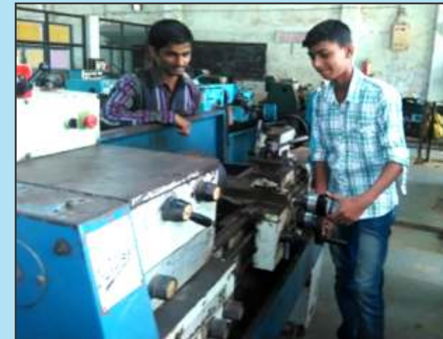
Promoting Skill-based Training among Youth