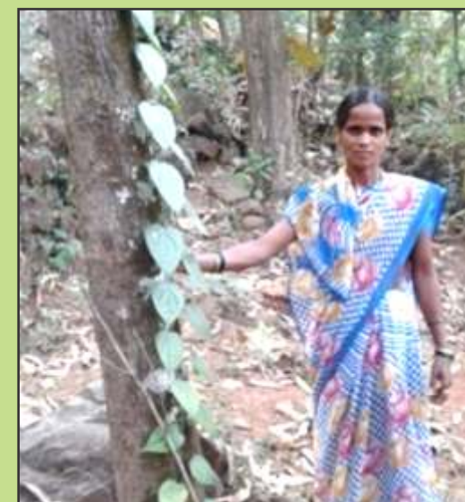
Promotion of Spice Plantation along with Bamboo resource development.