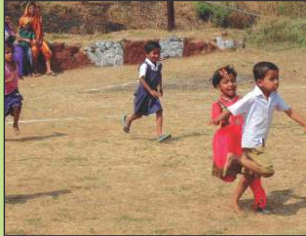
Central Sports Meet to encourage sports and games in Mahad