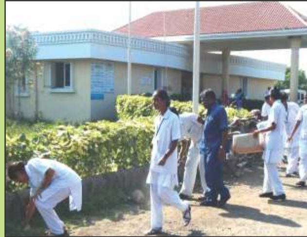
Cleanliness Drive for Swacha Bharat at SPARSH Rural Hospital