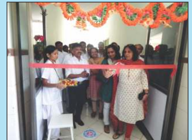
C.C.C. Inauguration at SPARSH Rural Hospital