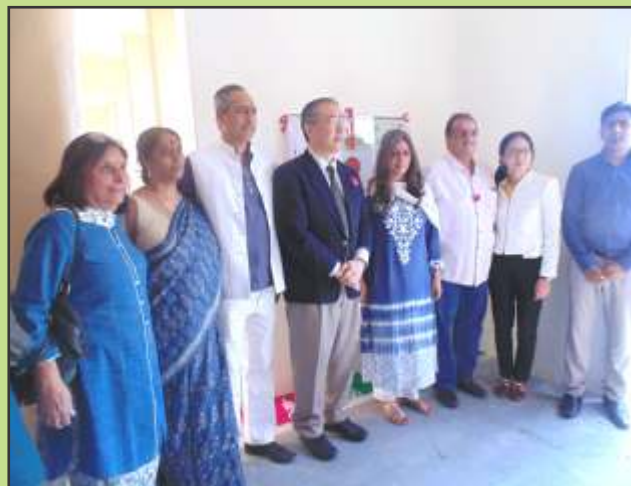
Training Center in Mahad inaugurated by Consulate General of Japan