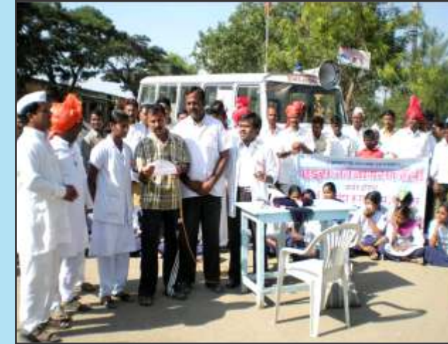
AIDS Awareness Campaign in Osmanabad district