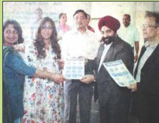
SBI Mutual Fund makes a generous in-kind donation to our Mahad program