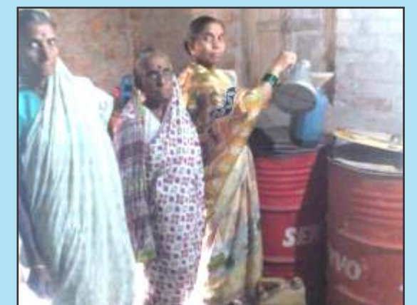
Women SHG members have acquired license to distribute kerosene in village households, easing the challenge of cooking arising from lack of kerosene for cooking stoves.