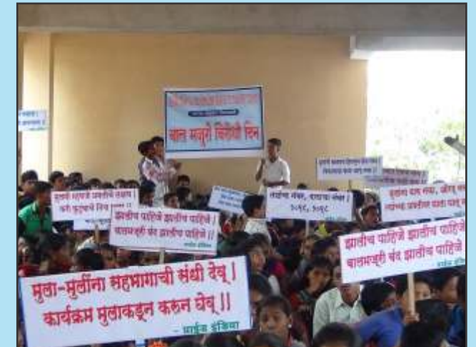
Rally Against Child Labour in Raigad