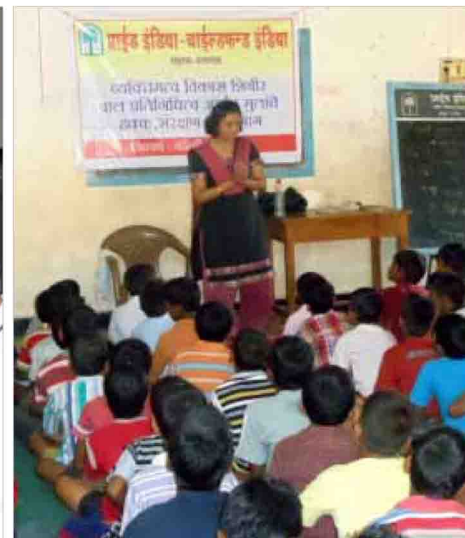
Medical officer discussing Adolescent health issues with boys during Personality development Camp