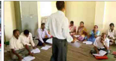
Staff Training on Child Protection and Participation