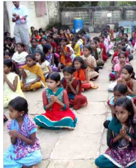
Personality Development Camp Organised for girls at Kothurde Muktashala