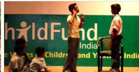
Children performing skit on child protection issues at SPANDAN- 60th year of completion of ChildFund India organised at Lucknow