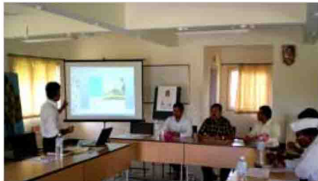
Meeting of Governing Body – Rugn Kalyan Samiti