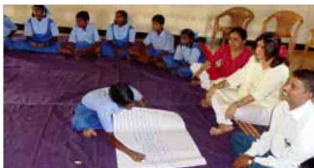
Chief Functionary with children during an exercise on Child Participation at Kothurde Muktashala