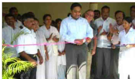
Opening Ceremony of Children Park