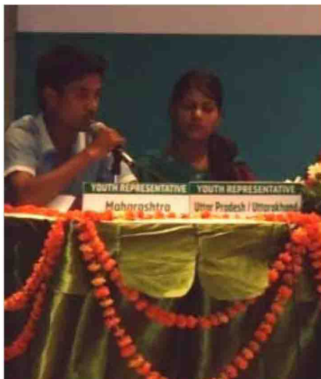
On the eve of the completion of their 60th year in India., ChildFundorganized SPANDAN 2011 at Lucknow.