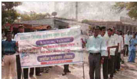
Awareness Rally on Malnutrition