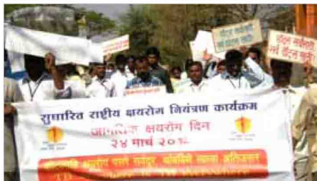
Awareness Rally against HIV - AIDS