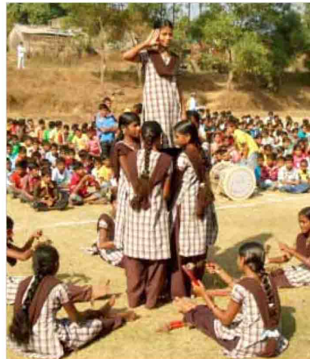
Children of Child Resource Centre of Muthavali Village participating in Winter Sports Competitions