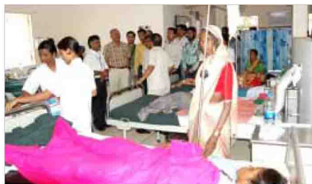
Visits of Doctor's