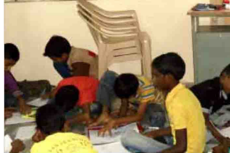
DRAWING COMPETITION for enrolled children sept 11