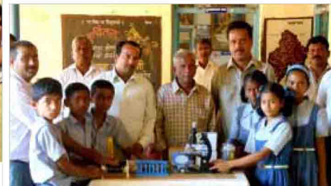
Children with Science Laboratory Material at Konjhar High school