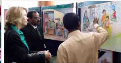
President and National Director ChildFund discussing at PRIDE India gallery during Spandan at Lucknow