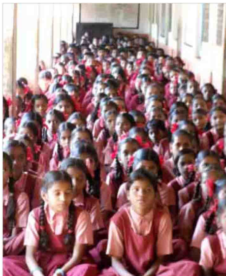
Awareness Program on Protection at Valang High School