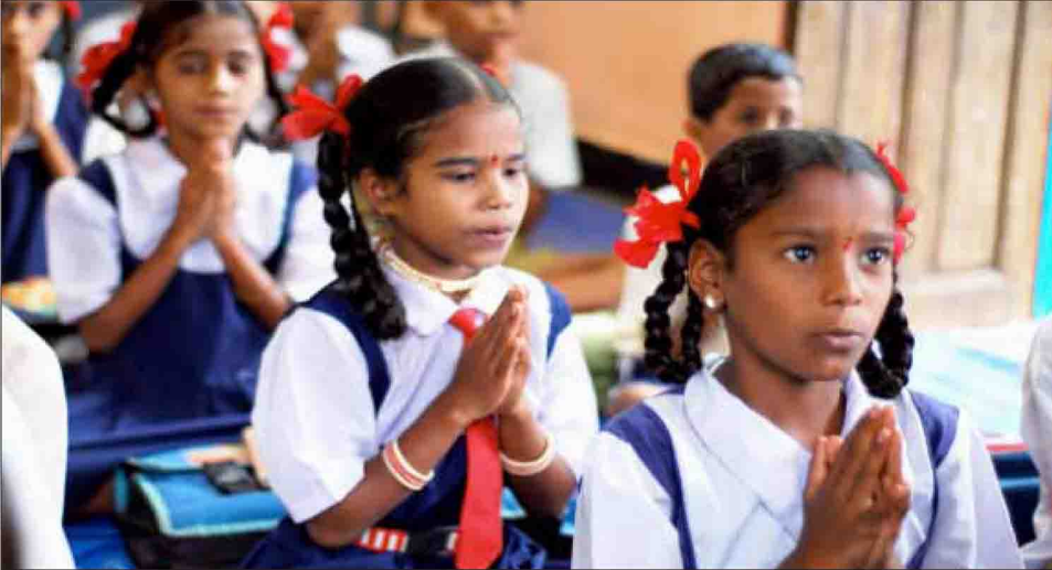
Personality Development Camps for members (107boys and 115 girls) of Children Clubs to participate in various activities like organizing Child Rights rallies, awareness campaigns against child labor and HIV/AIDS, Independence Day and Republic Celebrations at the school, essay writing contest, drawing contest, annual winter sports function thus developing their confidence, leadership qualities and make them stake holders in their development process.