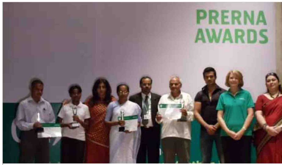
We take pride in announcing that the project was awarded the "PRERNA Award" for Excellence in Community Participation and Star Alumni Achiever by ChildFund India.