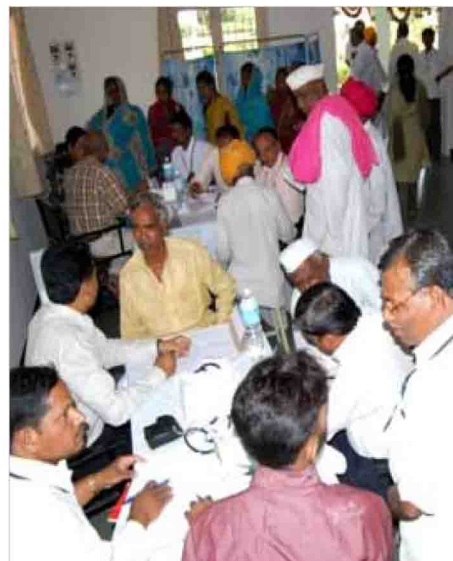
OPD of AYUSH Camp