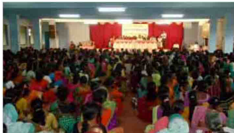
23 rd Annual General Meeting of Vipul Women Credit Cooperative Society