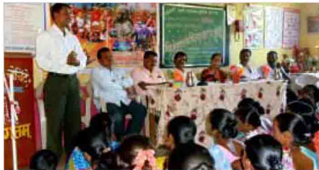
Discussion on child rights with Parent teacher association at Choquine Primary school